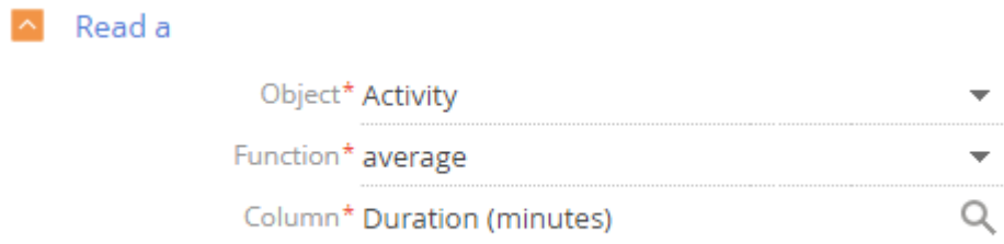
Fig. 2 — Example of configuring the [Read a] block in the calculated metric

[Column] — the column used for calculation. The list of values contains numeric and date columns. For example, to calculate the average duration of employee calls, select the "Duration (minutes)" value (Fig.2). The [Column] field will not display if you select the "count" value in the [Function] field.