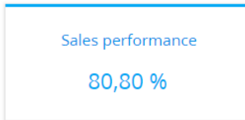
Fig. 1 — Example of a "Calculated metric" dashboard

The calculated metrics can use from 2 to 4 variable parameters in their formulas.